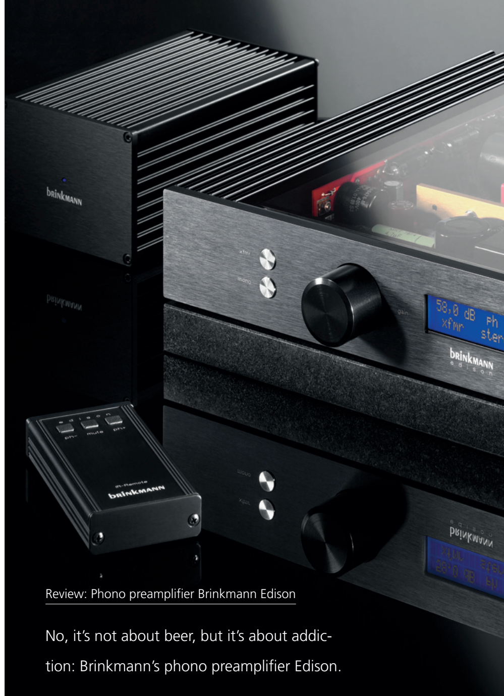
Review: Phono preamplifier Brinkmann Edison

Brinkmann fans were eagerly waiting his big phono preamplifier Edison. It